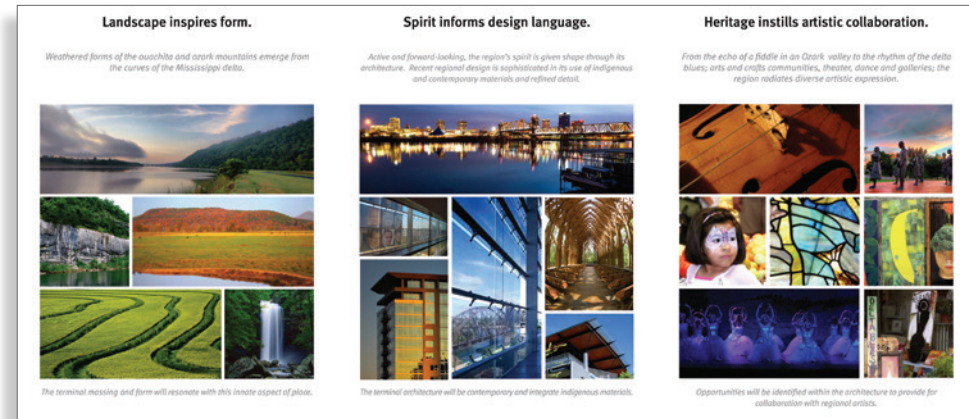
Sense of Place Inspiration

New Administrative Offices | Little Rock, AR